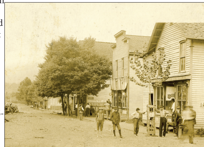
Above: Looking down Dillsboro's Front Street

Dillsboro has been a tourist town since 1886 when visitors began to arrive by train and spend several weeks. Word spread about the cool summers and beautiful mountain scenery.